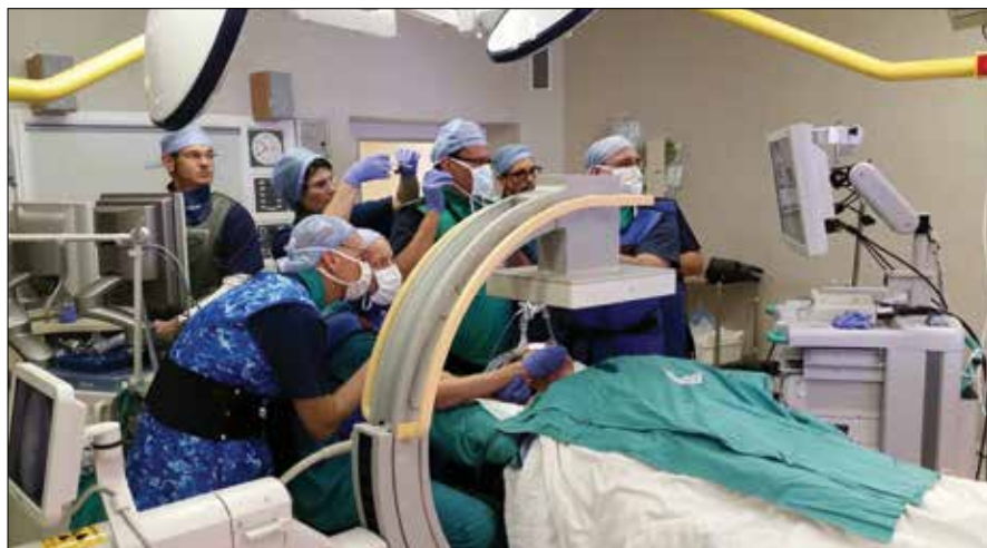
Fig. 1. The first procedure was performed on 16 September 2014 at Panorama Hospital, Cape Town.

S Afr Res J 2015;21(1):11. DOI:10.7196/SARJ.7737