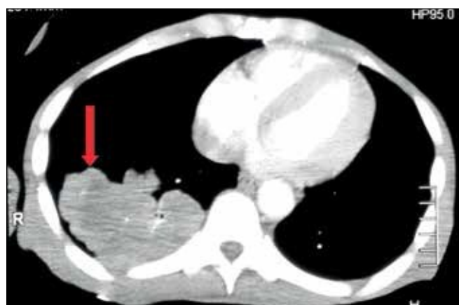
Fig. 2. CT scan demonstrating lobulated right lower lobe mass (red arrow).

medical history was unremarkable, except for chronic obstructive pulmonary disease (COPD) and long-standing, well-controlled epilepsy. Physical examination revealed a wasted patient with slow cognition not associated with any focal neurological deficits. Clinical examination revealed decreased breath sounds with dullness to percussion over the right lower lobe, and hepatomegaly extending 8 cm below the costal margin. Blood investigations showed marked elevation of his white cell count (peak level 114.18 \times 10^9/L ) with an absolute eosinophilia ranging from 29.81 to 82.33 \times 10^9/L during the course of his admission. The bone marrow trephine confirmed marked eosinophilia, with no malignant infiltrate or evidence of clonal eosinophilic proliferation (absence of the FIP1L1/PDGFR A fusion gene on fluorescence in situ hybridisation (FISH) analysis). The chest radiograph showed a well-circumscribed lesion in the