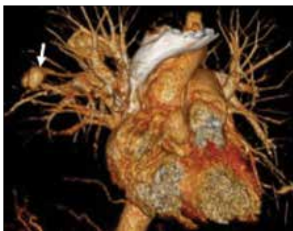
Fig. 3. 3D reconstruction demonstrating the angio-architecture of the pulmonary circulation with the arrow showing the PAVM.