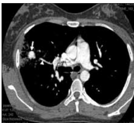
Fig. 2. Axial slice of CTPA demonstrating the pulmonary arteriovenous malformation (arrow) with surrounding haemorrhage and a feeding vessel (arrowhead) extending from the right hilum.

In view of the severity of the patient's symptoms and her abnormal chest X-ray, CTPA was regarded as the imaging modality of choice. The CTPA demonstrated a large pulmonary arteriovenous malformation (PAVM). The patient subsequently underwent successful coiling of her PAVM (Fig. 4) and had an uncomplicated vaginal delivery. Repeat CTPA confirmed retraction of the aneurysmal sac. Prior to discharge, the patient was counselled regarding the risks related to PAVM in future pregnancy and was offered contraception.